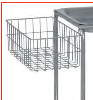
slide removable basket