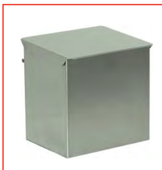
stainless steel waste bucket